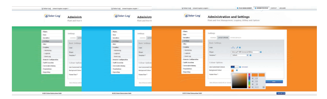
Template with different sample colors

The possibility to customize the design of your own platform is a huge service benefit for installers. A range of function modules are available that can be integrated as required at the touch of a button without expert knowledge. Pages individually designed with HTML can also be integrated. Precise color selection and HTML coding make it possible to customize the appearance to match the customer's corporate design.